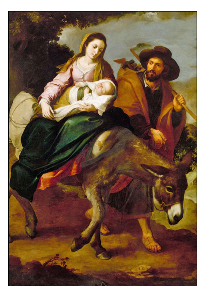
THE FLIGHT INTO EGYPT