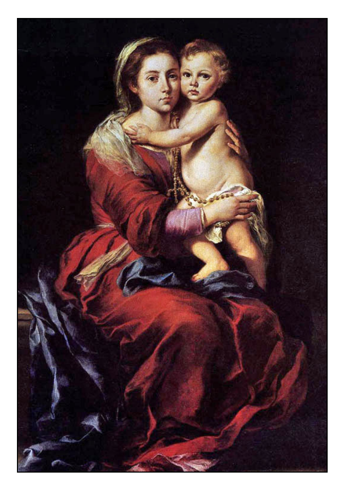
VIRGIN AND CHILD WITH A ROSARY