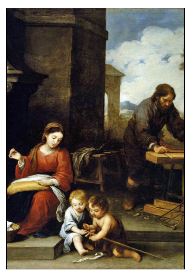
THE HOLY FAMILY WITH THE INFANT ST. JOHN THE BAPTIST