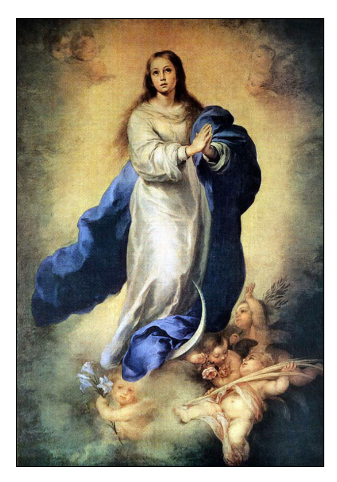
THE IMMACULATE CONCEPTION