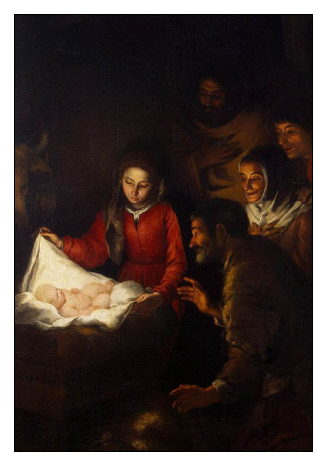
ADORATION OF THE SHEPHERDS