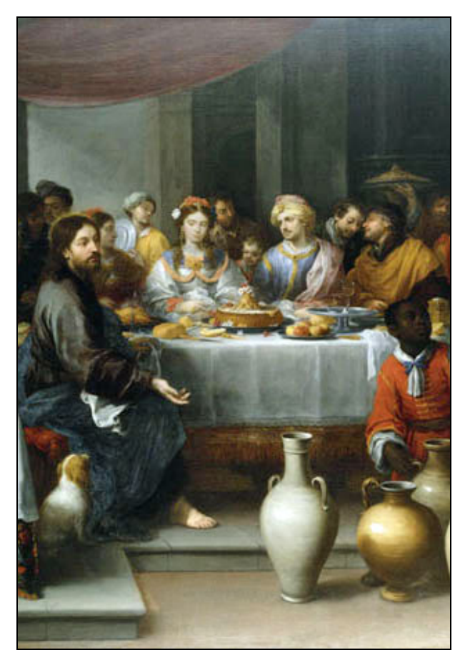
THE MARRIAGE FEAST AT CANA