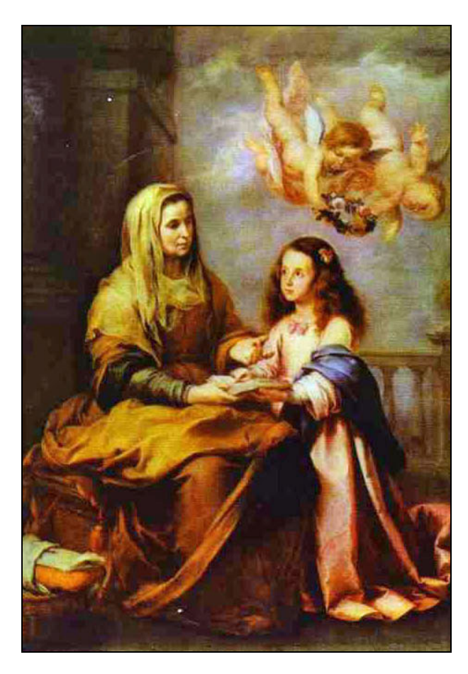
CHILDHOOD OF THE VIRGIN MARY