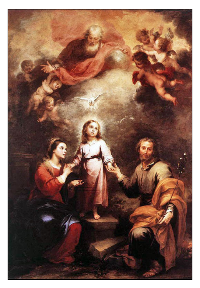
THE TWO TRINITIES